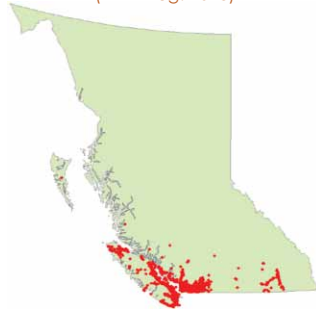
Distribution in BC (IAPP Aug. 2013)

Currently found in BC in the Lower Mainland, Sunshine Coast, Fraser Valley, Gulf Islands, central to southern Vancouver Island, Queen Charlotte Islands, the Okanagan, and the West Kootenay areas.